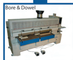
Bore & Dowel

SUCCESS IS NOT ONLY ABOUT MACHINES. IT'S PARTNERING WITH PEOPLE THAT MAKE YOUR EXPERIENCE AN EXCEPTIONAL ONE.